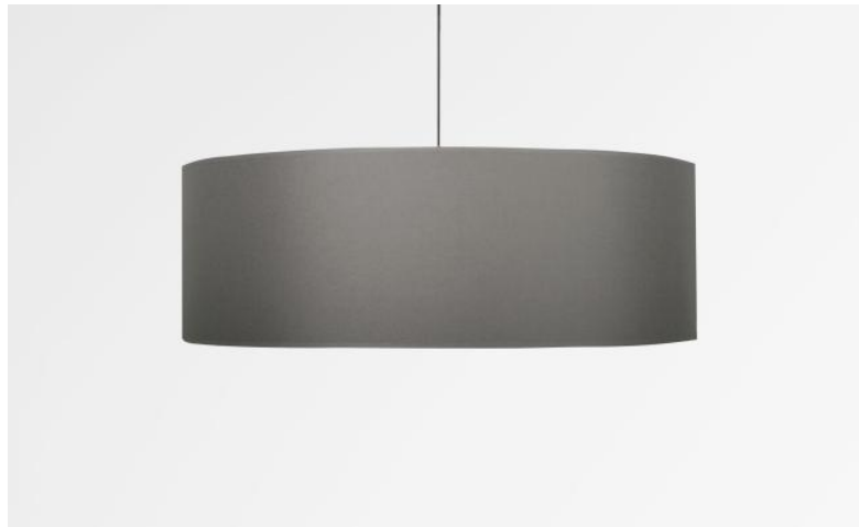
Lampshade KENTIKA 50 SHORT in Seta plomb (fabric from category 3)