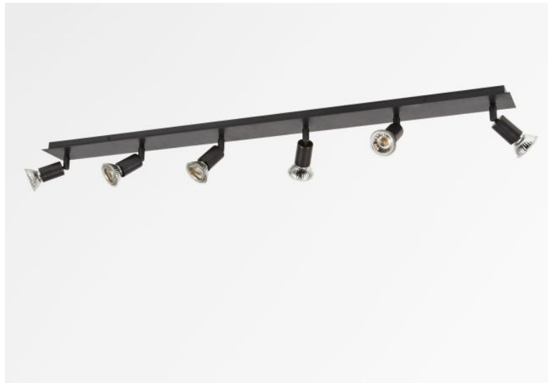
MERCURE 6 in brushed bronze. Metal finish code: 29