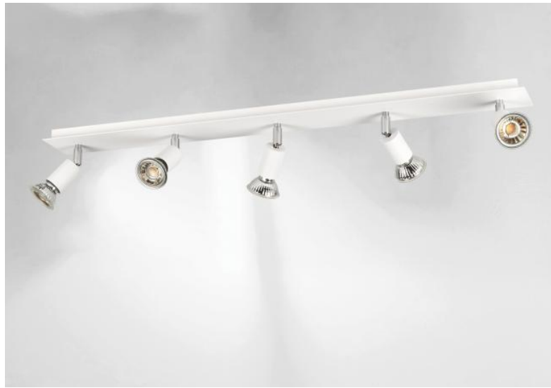
MERCURE 5 in structured white