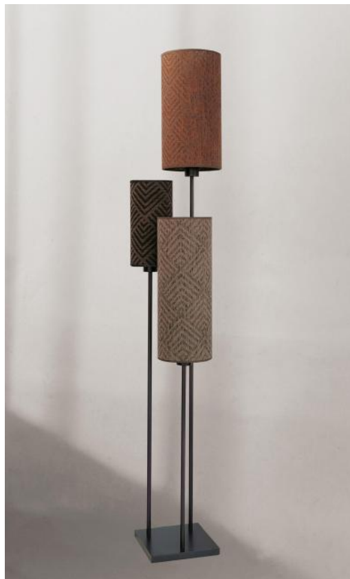
NOUKAR in brushed bronze with lampshades in Arrow (fabrics from category 4)