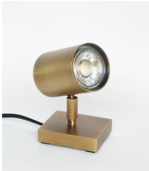
MAGELLAN PL in light bronze. Metal finish code: 28