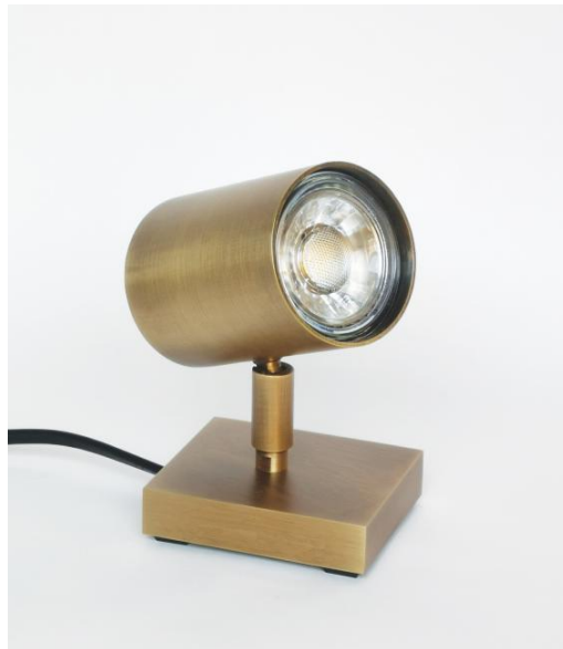
MAGELLAN PL in light bronze. Metal finish code: 28