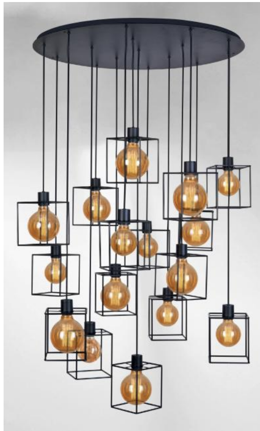
KERMA 16 o83 in structured black with structures in black epoxy