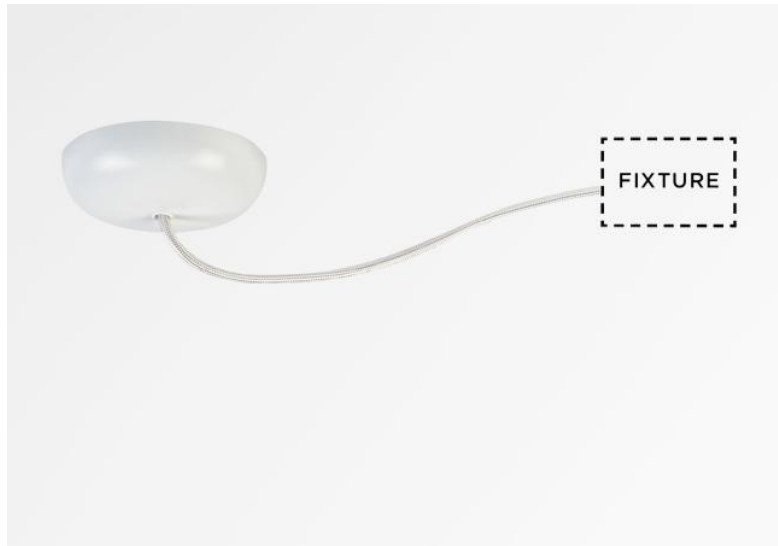
ADAPTER CEILING o in structured white