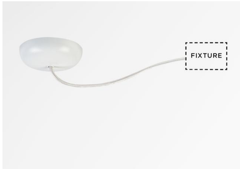
ADAPTER CEILING o in structured white