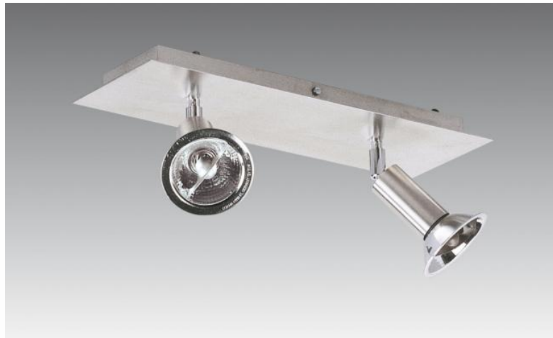
JUPITER 2 in brushed nickel