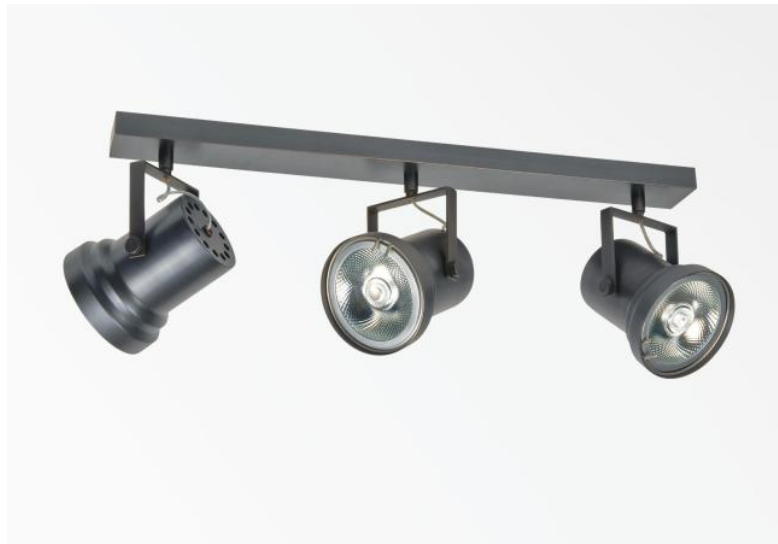
ATHENA 3 in brushed bronze. Metal finish code: 29