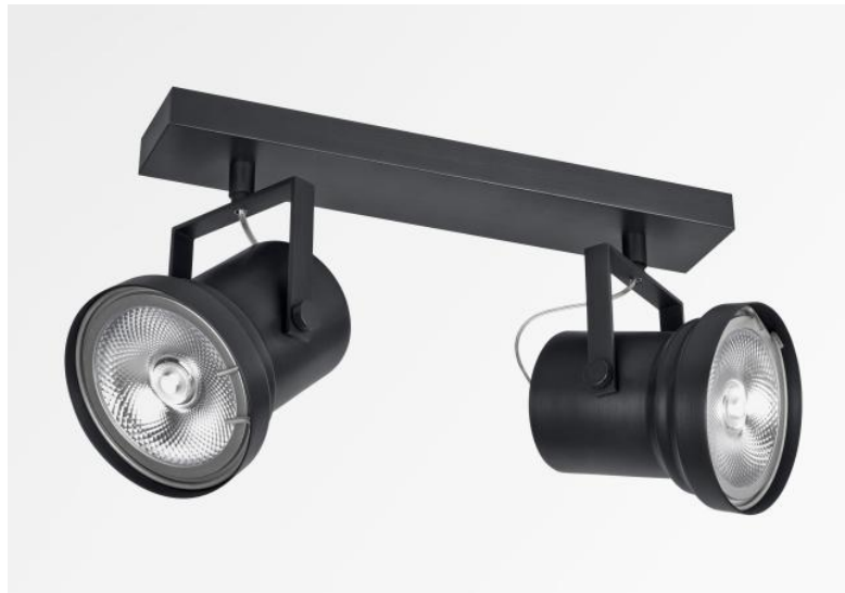
ATHENA 2 in brushed bronze. Metal finish code: 29