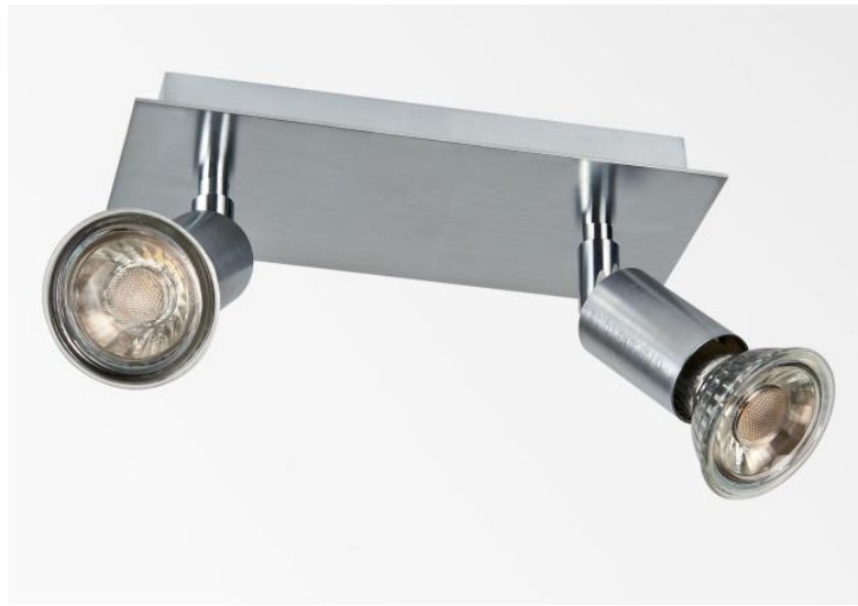
MERCURE 2 in brushed chrome