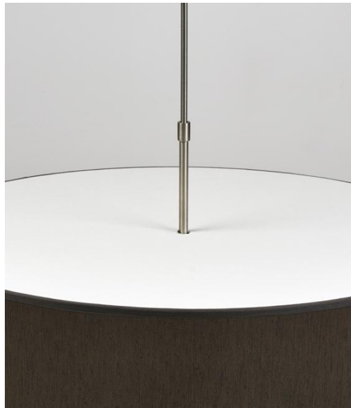
MOSQUITO NET stretched and glued on top of of a KENTIKA 70 lampshade