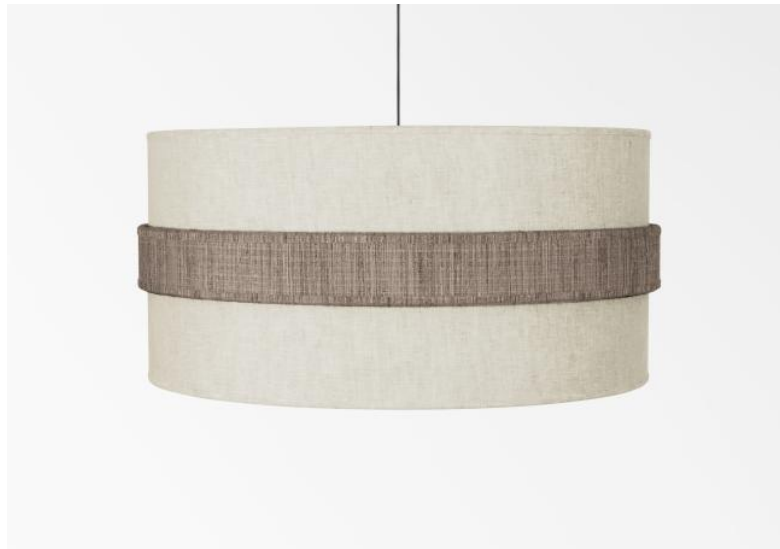
Lampshade TOUYA 50 in Lin Moscou (fabric from category 2) with ring in Turda châtain