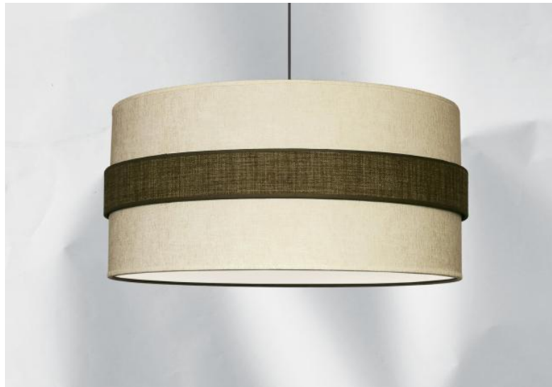
Lampshade TOUYA 45 in Trento Jute (fabric from category 3) with ring in Sami Café