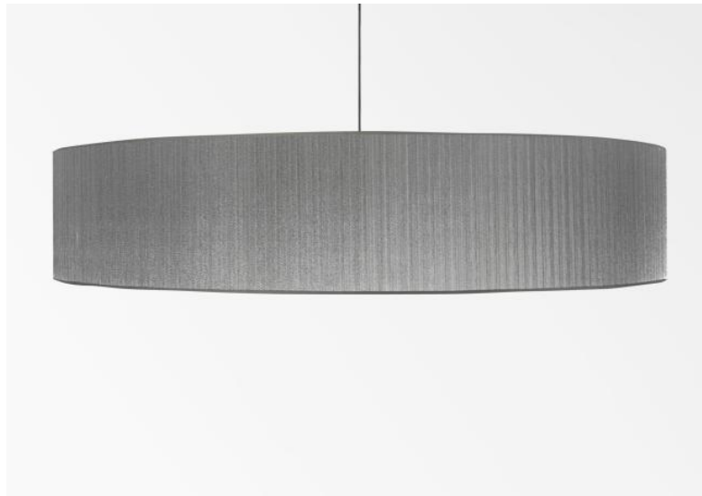
Lampshade KENTIKA 100 SHORT in Plissé argent (fabric from category 4)