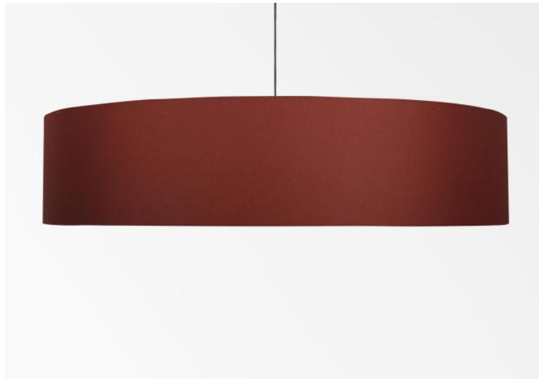
Lampshade KENTIKA 90 SHORT in Seta pourpre (fabric from category 3)