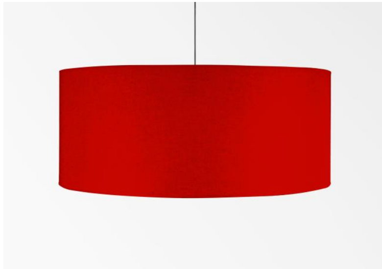
Lampshade KENTIKA 80 in Coton rouge (fabric from category 1)