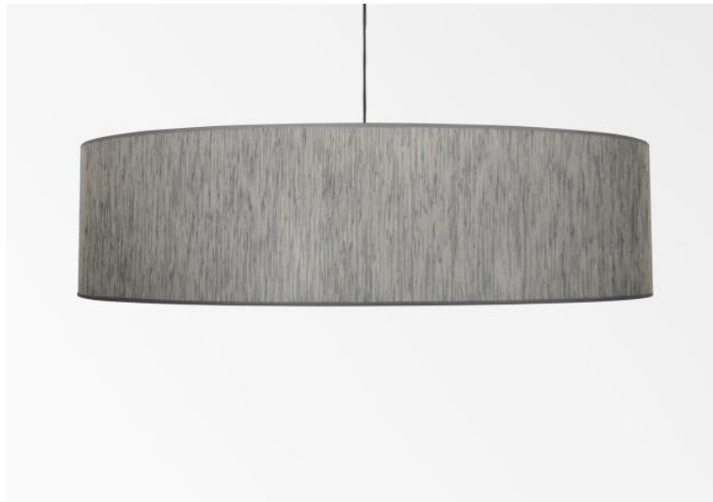
Lampshade KENTIKA 80 SHORT in Véronie (fabric from category 3)