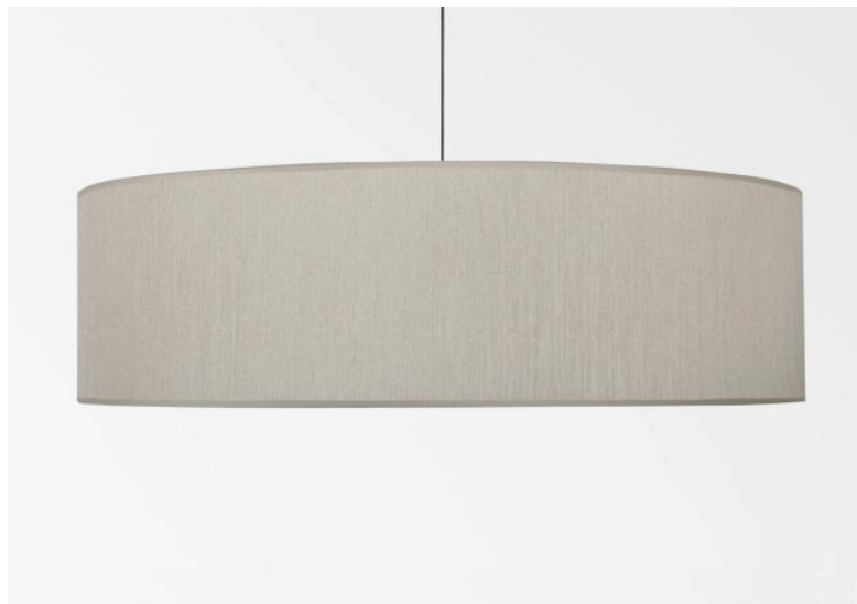
Lampshade KENTIKA 70 SHORT in Crémone (fabric from category 3)