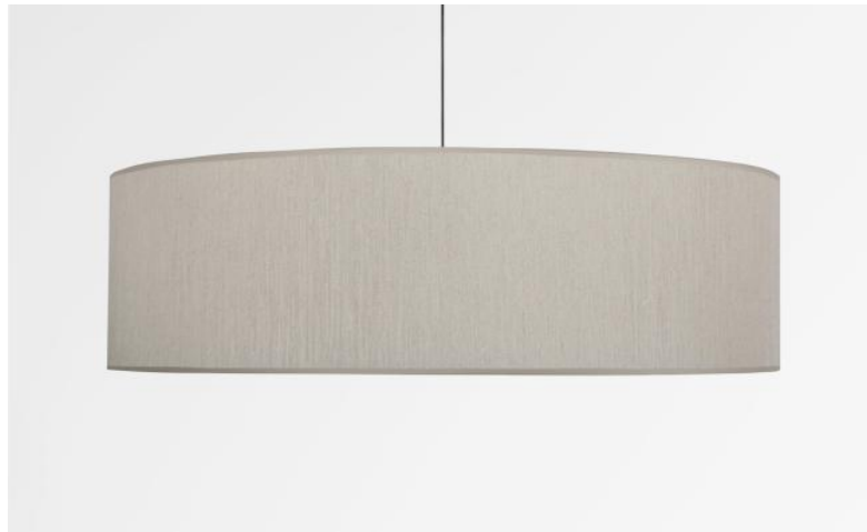
Lampshade KENTIKA 70 SHORT in Crémone (fabric from category 3)