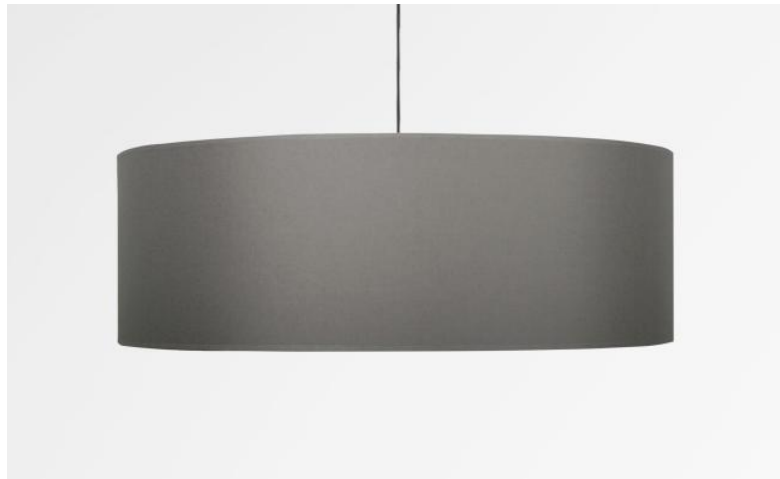
Lampshade KENTIKA 60 SHORT in Seta plomb (fabric from category 3)