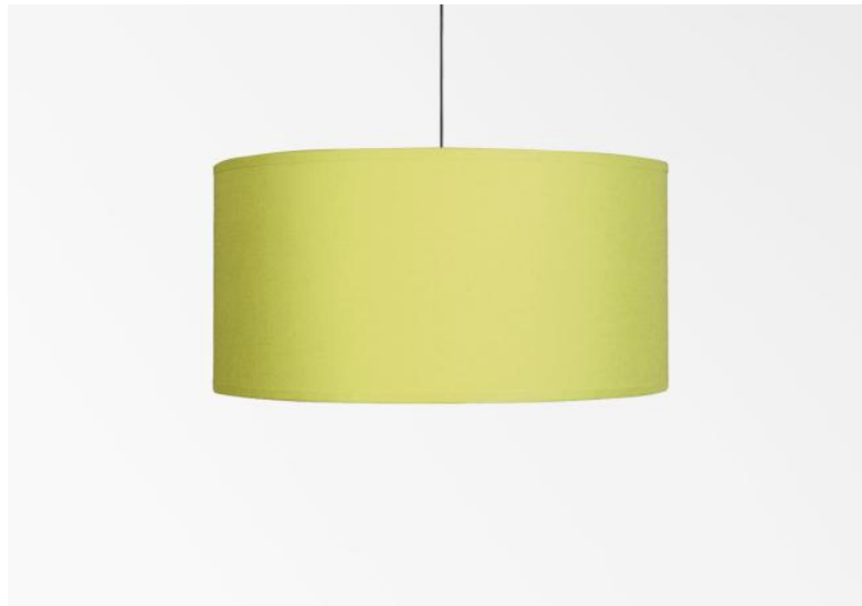
Lampshade KENTIKA 50 in Seta lemon (fabric from category 3)