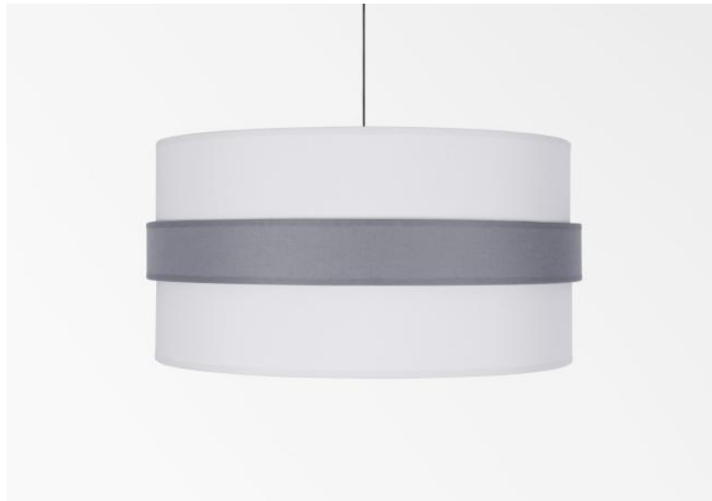
Lampshade TOUYA 35 in Coton calcaire (fabric from category 1) with ring in Coton schiste