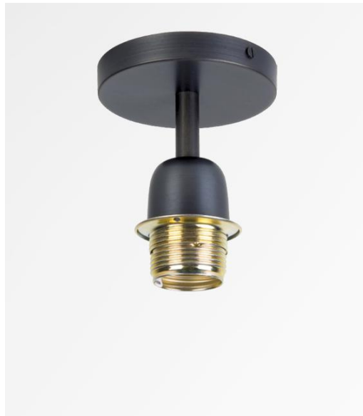
KENTIKA E27 in brushed bronze