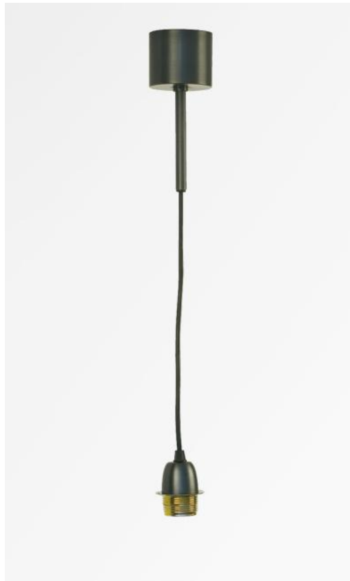
SUSPENSION PAVILLON in brushed bronze