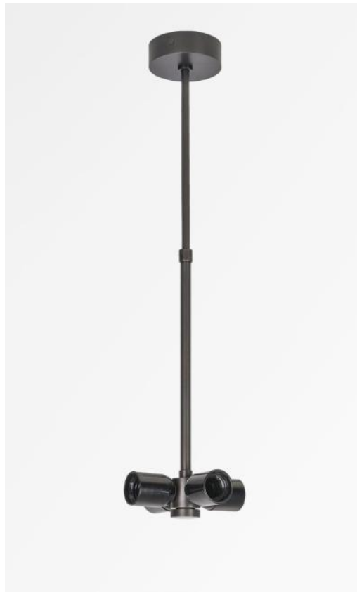
SUSPENSION GOLIATH in brushed bronze