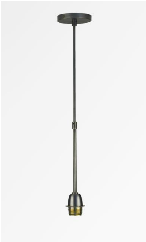
SUSPENSION o TUBES in brushed bronze