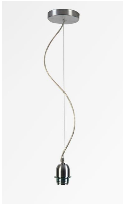
SUSPENSION STEEL CABLE in brushed nickel