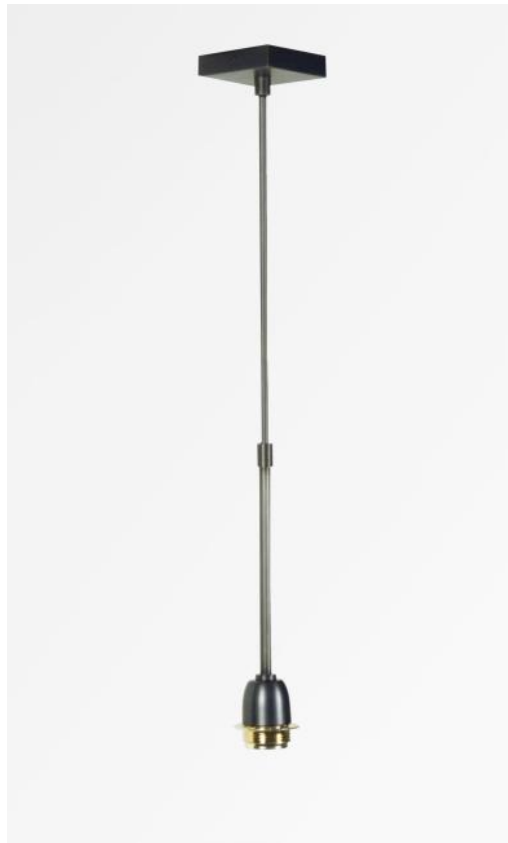
SUSPENSION # TUBES in brushed bronze