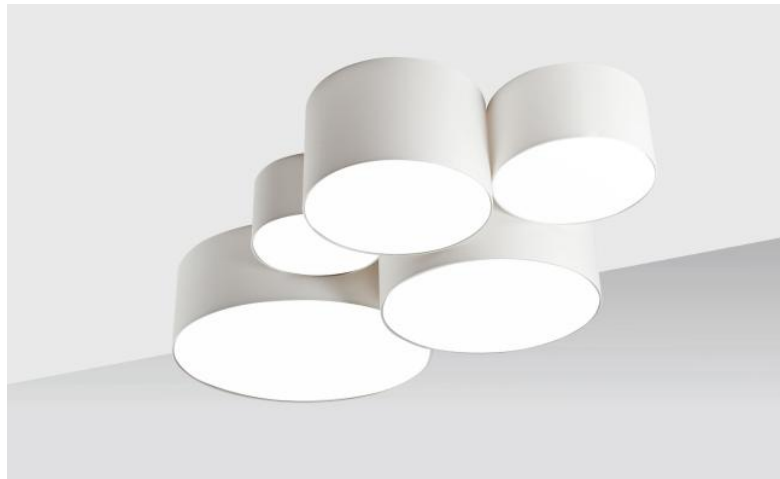
Lampshades NAPATA in Coton calcaire (fabric from category 1)