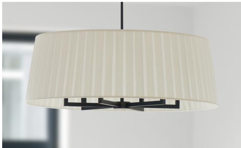
TOURAH 6 LARGE in brushed bronze with lampshade in Ø100cm in Plissé Cousu Main