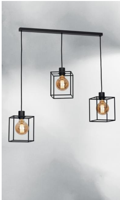
KERMA L 3 in brushed bronze with structures in black epoxy