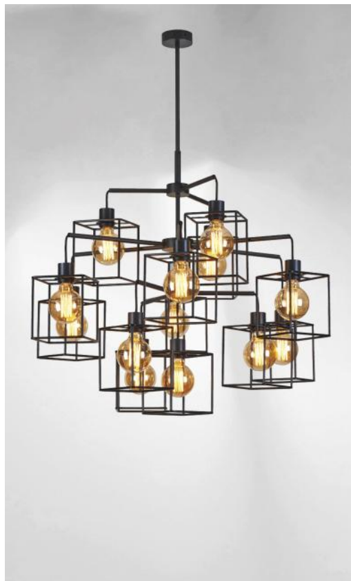
KERMA LUSTRE in brushed bronze with structures in black epoxy