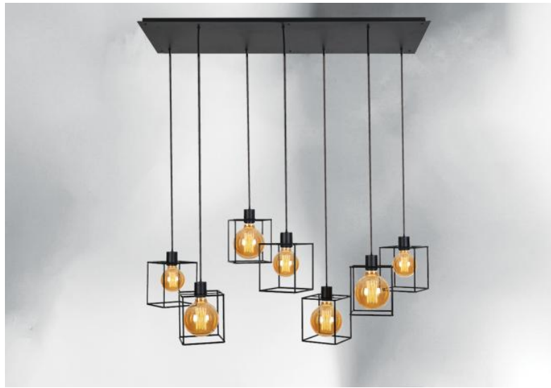
KERMA 7 # in brushed bronze with structures in black epoxy