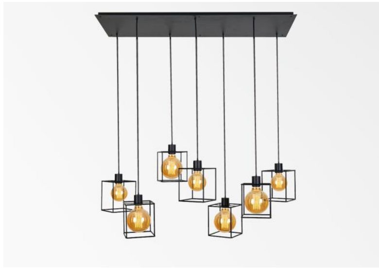
KERMA 7 # in brushed bronze with structures in black epoxy