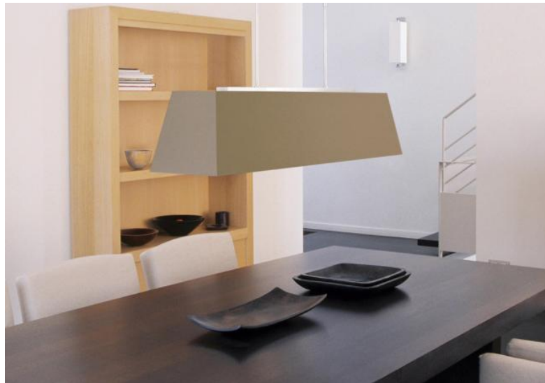
HENOUTMIRE 3 in brushed nickel with lampshade LARGE in Seta taupe (fabric from category 3)