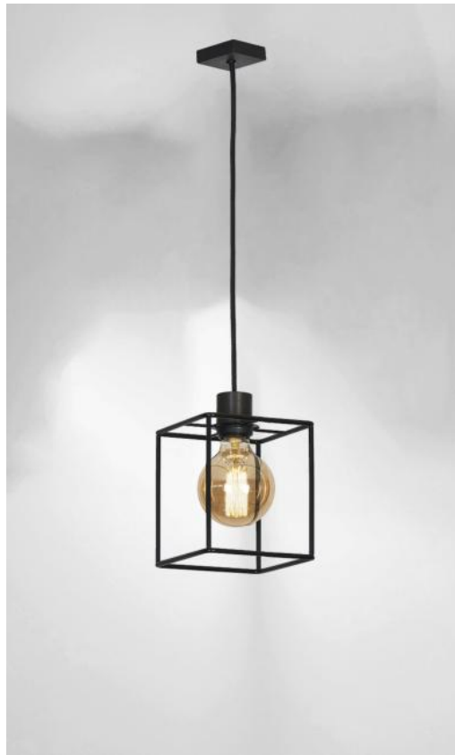
KERMA SQUARE 1 in brushed bronze with structure in black epoxy