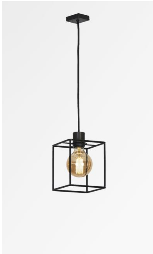
KERMA SQUARE 1 in brushed bronze with structure in black epoxy