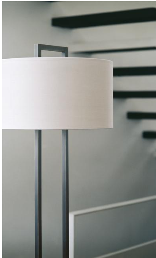
SATIS FLOOR in brushed bronze with lampshade in Coton Calcaire (fabric from category 1)