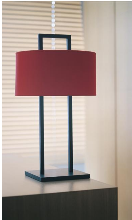
SATIS in brushed bronze with cylindrical lampshade Seta Framboise (fabric from category 3)