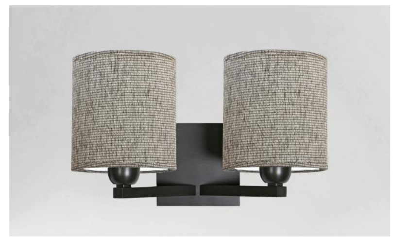
SECHAT in brushed bronze with lampshades in Esmaria Avoine (fabric from category 3)