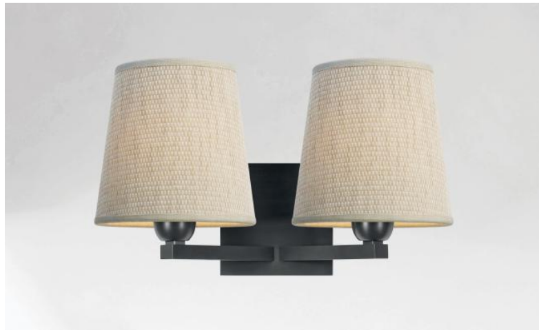
SECHAT in brushed bronze with lampshades in Parma Merisier (fabric from category 4)