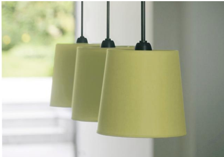
ARSINOE in brushed bronze with lampshades in Coton Vert Prairie (fabric from category 1)