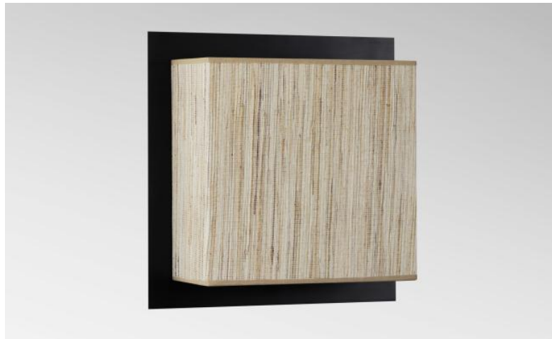
DEIR 2 in brushed bronze with lampshade in Jacinthe Naturelle (material from category 5)