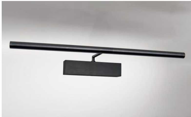
MEIDOU M 55 in brushed bronze. Metal finish code : 29