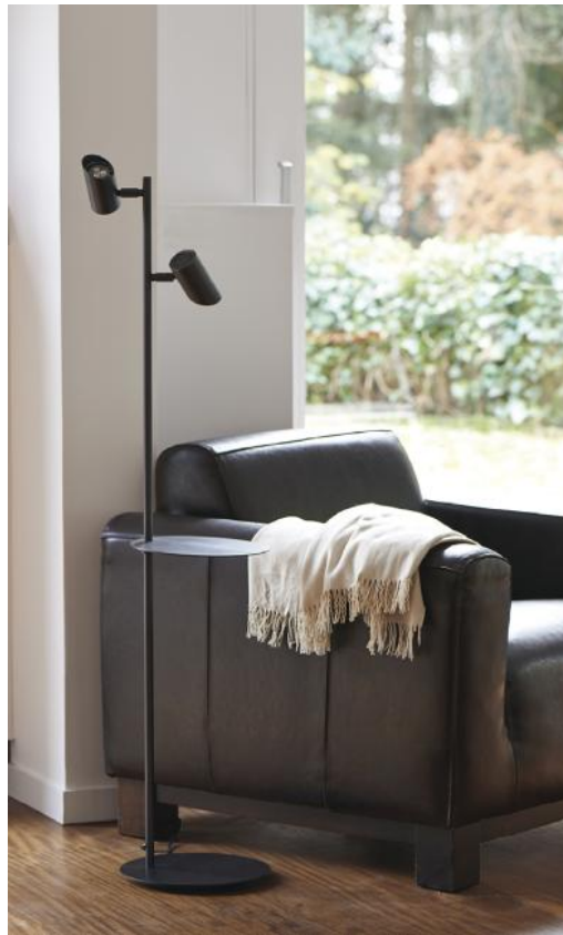
HERMES in brushed bronze