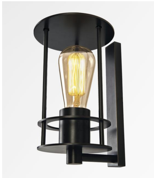
MARINER in brushed bronze