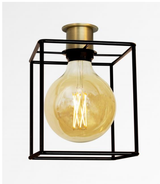
CHARON in light bronze with a KERMA structure and a decorative bulb