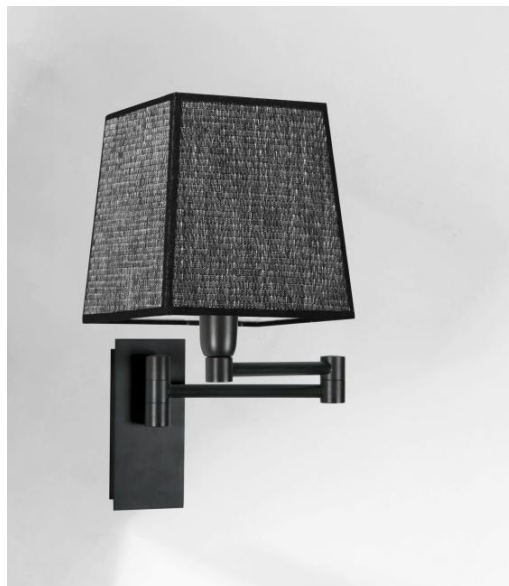
AHMOSIS -SW in brushed bronze with lampshade in Parma Régisse (fabric from category 4)