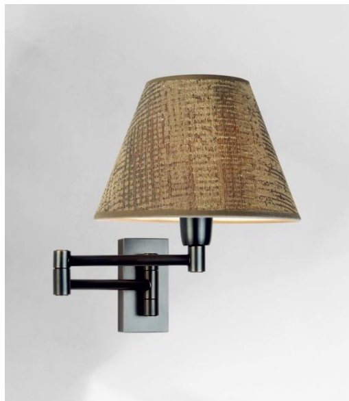
MAMMISI -SW in brushed bronze with lampshade in Wilg Wengé (fabric from category 3)