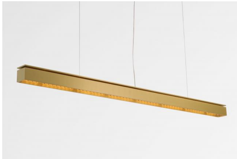
GALAND J # in light bronze