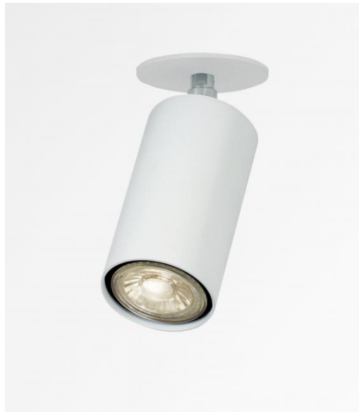
DEIMOS P1 o in structured white