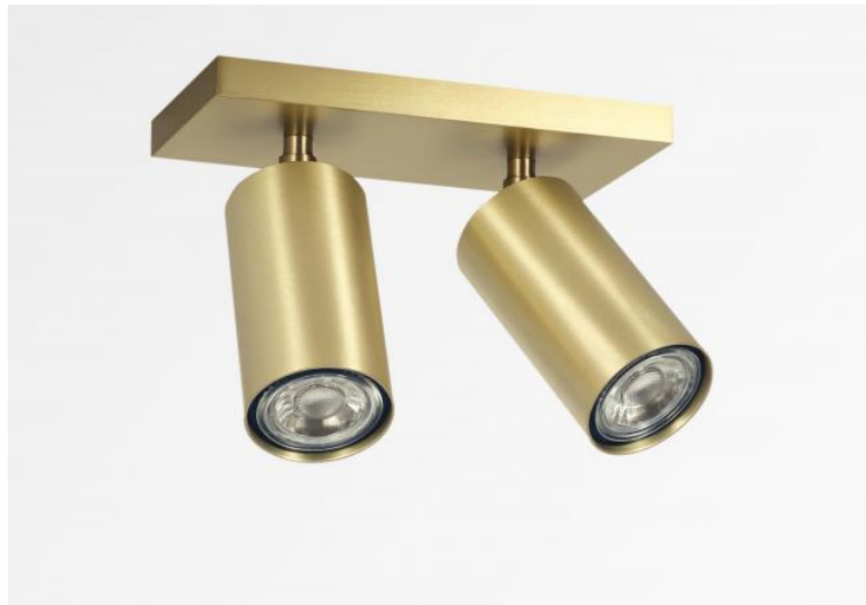
DEIMOS S2 # in brushed brass (code 25)